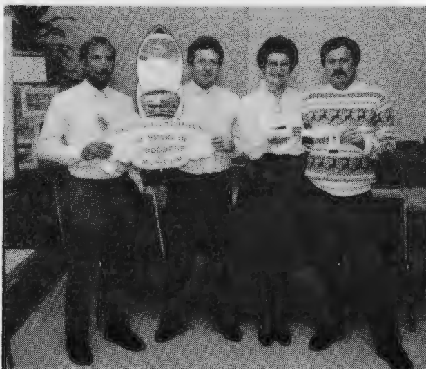
30 Year Committee