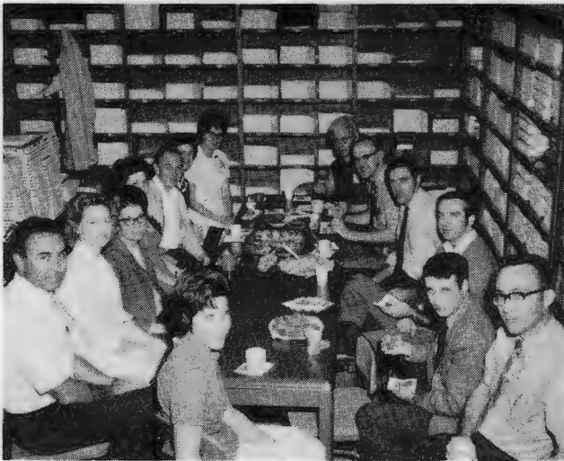
Christmas break in reprographics – 1967