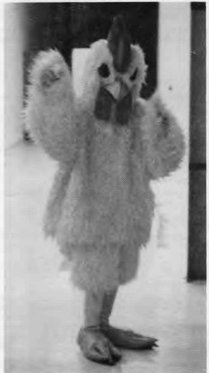
Fairchild bids farewell to its' Favorite "Chick"