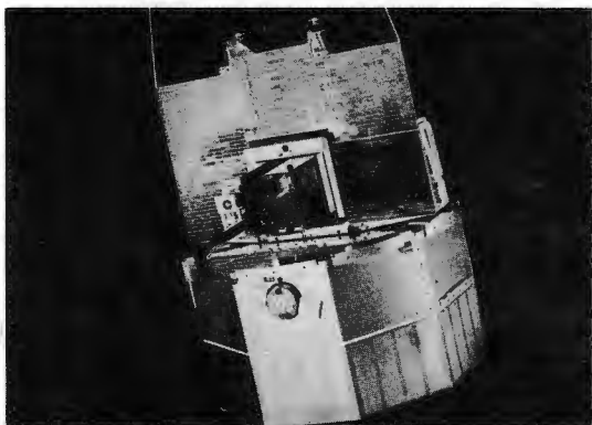
OSO-7, 1400-pound satellite, carries White Light Coronagraph and other sun-studying experiments, as well as PCM telemetry produced at EMR-T.