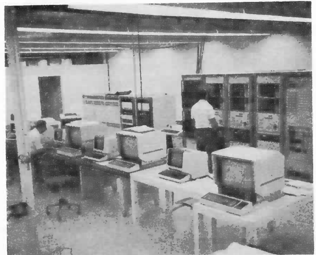
This partial view of the McClellan Air Force Base FDAPS ground station shows Jack Cain and Don Riker at work on the system.

perform preliminary information processing on the high speed flow of measurements prior to processing by the main system computer.