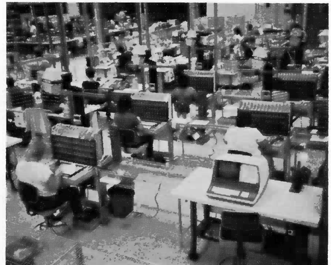
This overview of the relocated Printed Wiring Assembly area shows five Ragen component insertion machines in the foreground.

The next major renovations are scheduled to take place in our Sheet Metal Shop beginning in October. The new layout and renovations in the Sheet Metal Shop are aimed at improving our work flow and providing a more attractive work area for employees.