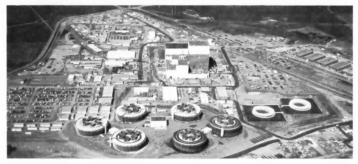
The giant Washington Public Power Supply Service, Nuclear Plant #2, at Hanover Reservation outside of Richland, Washington. This WPPSS nuclear power plant is approximately 95% complete.

A major Data Systems Division telemetry system successfully completed on-site acceptance testing at the Washington Public Power Supply System nuclear power plant in Richland, Washington, during May. The system is valued at over $2 million.