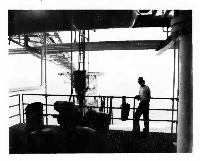
Chuck Berster standing on oil production platform during his visit to the offshore oil platforms in the Persian Gulf. Above Chuck is the Gas Extractor.

Chuck Berster was standing on Gas Lift Platform as he took this picture. At left is a Gas Extractor, atop the central production platform. The Gas Extractor recovers the natural gas previously injected into the well casing. At right is another platform where a contractor (Dugas) buys the recovered natural gas and sells it to its customers -- 60 miles away -- via a sub-sea pipeline.