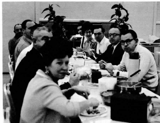
...and more Production Test personnel