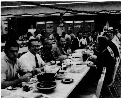
Production Test personnel feasting...